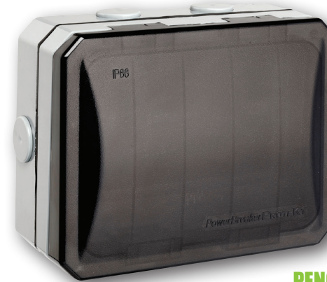
PENC2G with Closed Lid