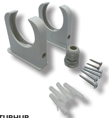
TUBHUB Thermostat Brackets

TUBH6TH 360W With Thermostat 6ft L1878mm x 55.4mm