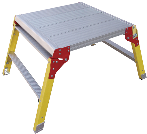
LADPF600 WORK PLATFORM - Max load 150kg