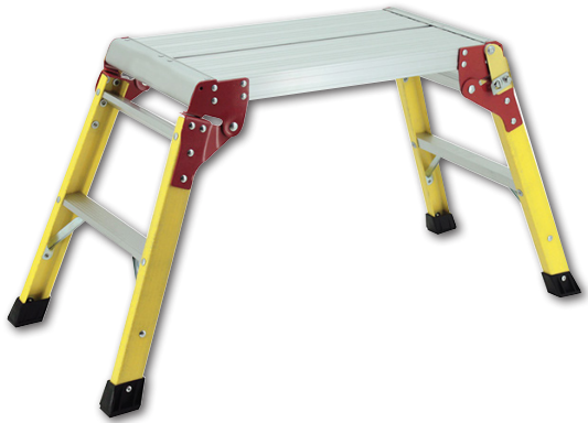
LADPF300 WORK PLATFORM - Max load 150kg