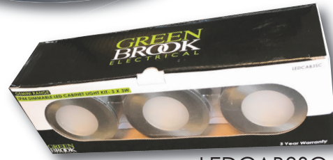
LEDCAB3SC Satin Chrome Triple Box shown