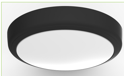
Shown with Matt Black Tamper-proof Screws Bezel

NV14WT - 330mm dia x 90mm high NV22WT - 405mm dia x 90.2mm high