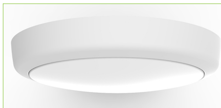
Shown with White Gloss White Clip on Bezel

NV14WT - 330mm dia x 90mm high NV22WT - 405mm dia x 90.2mm high